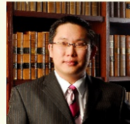
Lam Ko Luen Building, Construction & Engineering