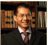
Jalalullail Othman Islamic Finance